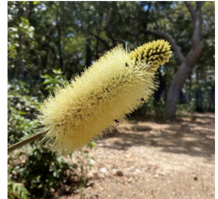
Bottlebrush Grass Tree

Xanthorrhoea johnsonii - Advanced Grasstree