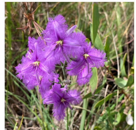
Purple Fringe Lilly