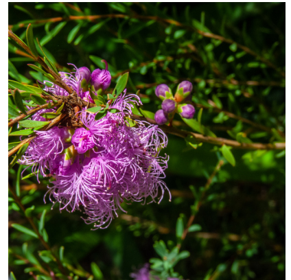
Thyme Honey Myrtle