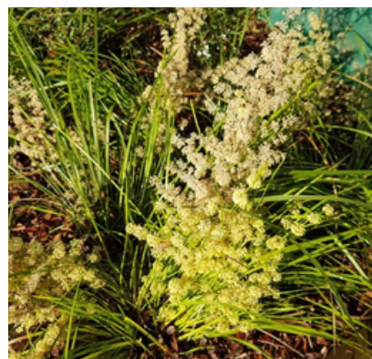
Many-Flowered Mat Rush