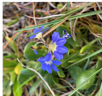
Beach Fan Flower