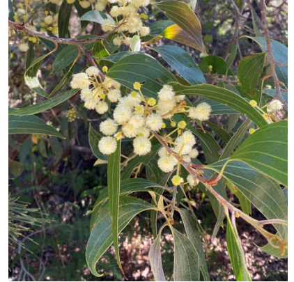
Primrose Ball Wattle

Corymbia ptychocarpa - Swamp Bloodwood (not local, but beautiful)